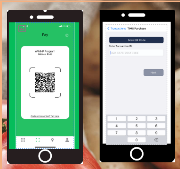
Merchant selects "Scan QR code" and scans the QR code with the phone's camera.

Recipients without smart devices receive a printed QR code. Merchants scan the QR code the same way.